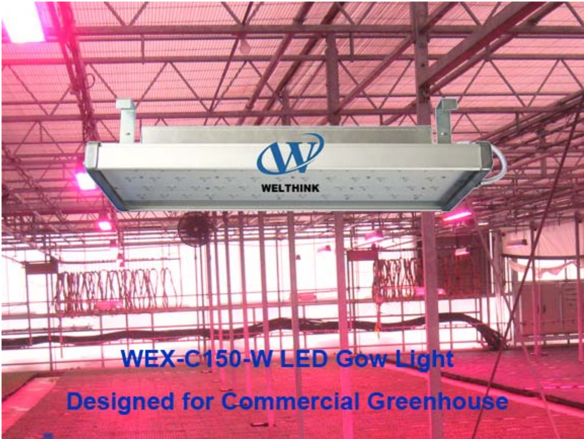
WEX-C150-W LED Grow Light Designed for Commercial Greenhouse